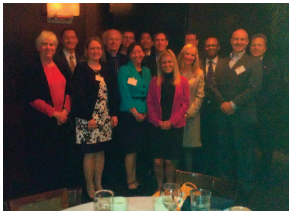
Above, members of the newly accepted 2012-2013 CCW officers and board of directors gather following the annual dinner on May 15th.