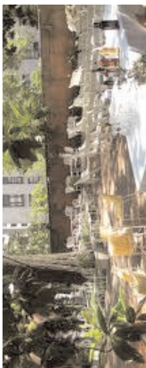
DACOR-Bacon House (and Garden) Friday, May 20th, 6:30 to 8:30 pm 1801 F Street, NW (at 18th Street) Washington, DC