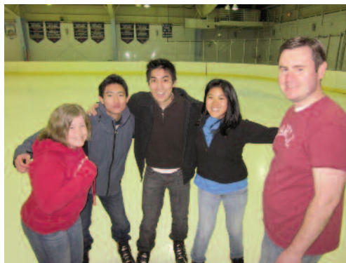
Happy skaters, left, at CCW's evening of ice skating at Mount Vernon's Recreation Center, March 12th.