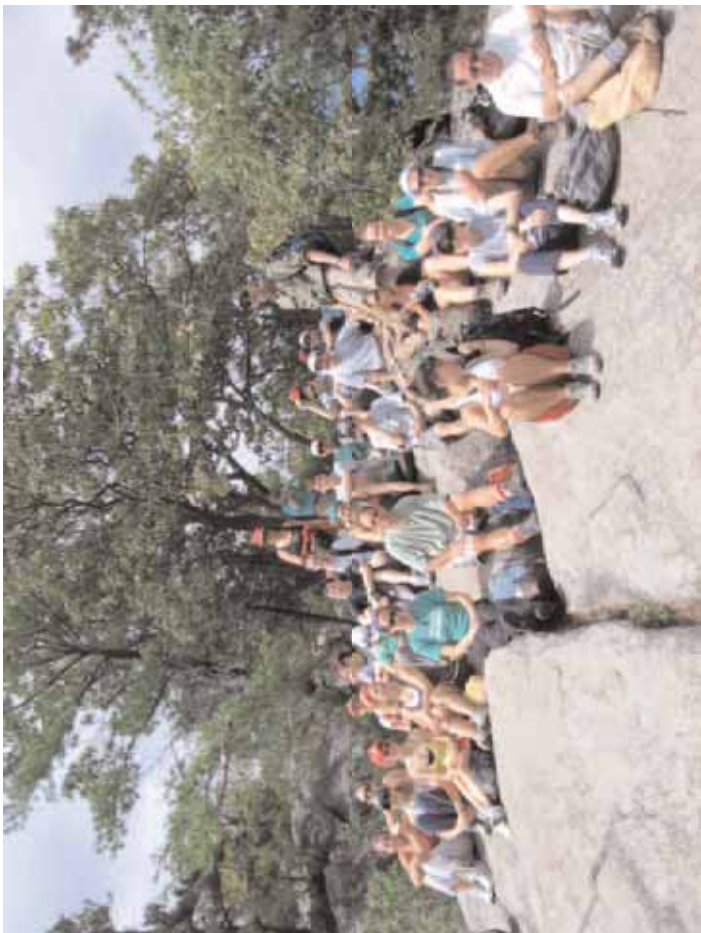
Old Rag XLVII: Cornellians atop beautiful Mt. Rag on a stunning fall day.