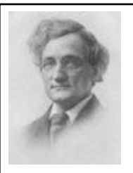
Liberty Hyde Bailey